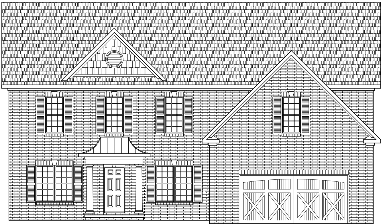
PROPOSED FRONT ELEVATION 'A'