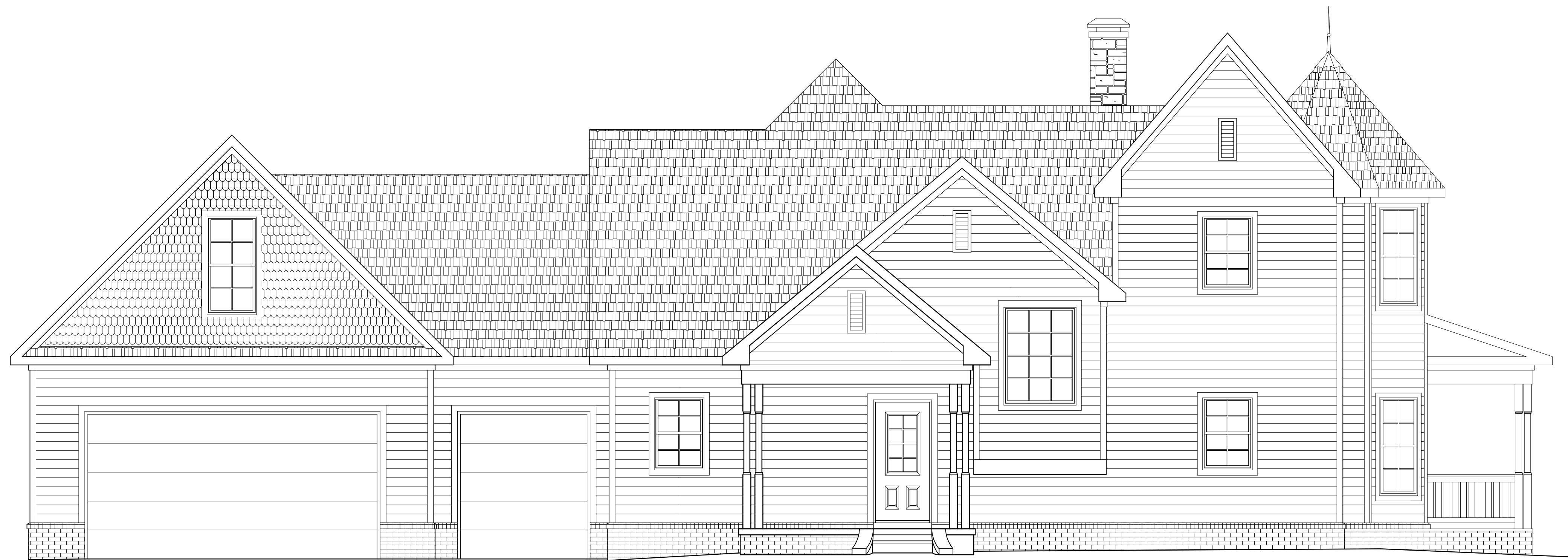
PRELIMINARY REAR ELEVATION