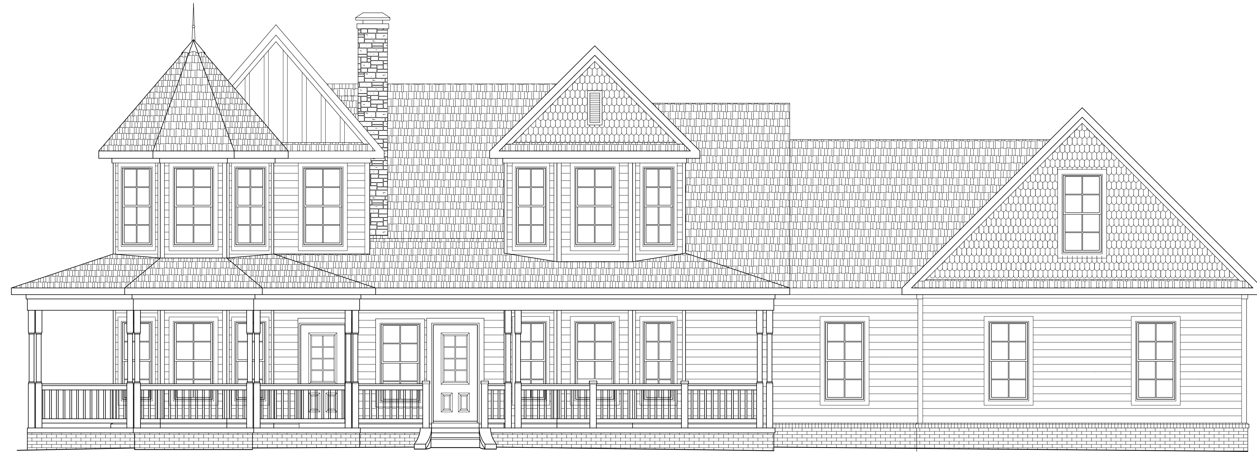
PRELIMINARY FRONT ELEVATION