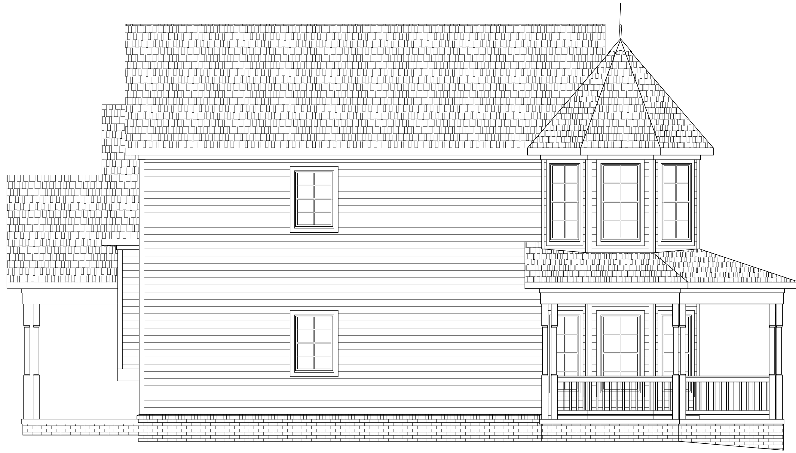
PRELIMINARY LEFT SIDE ELEVATION