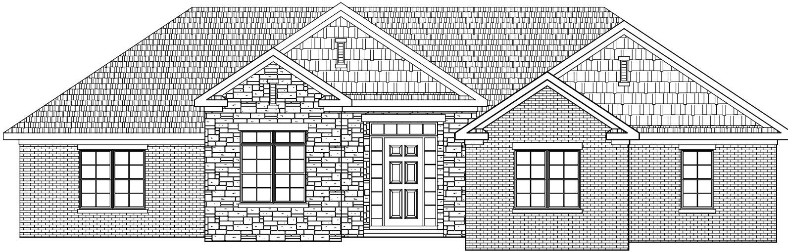
PROPOSED FRONT ELEVATION 'B'